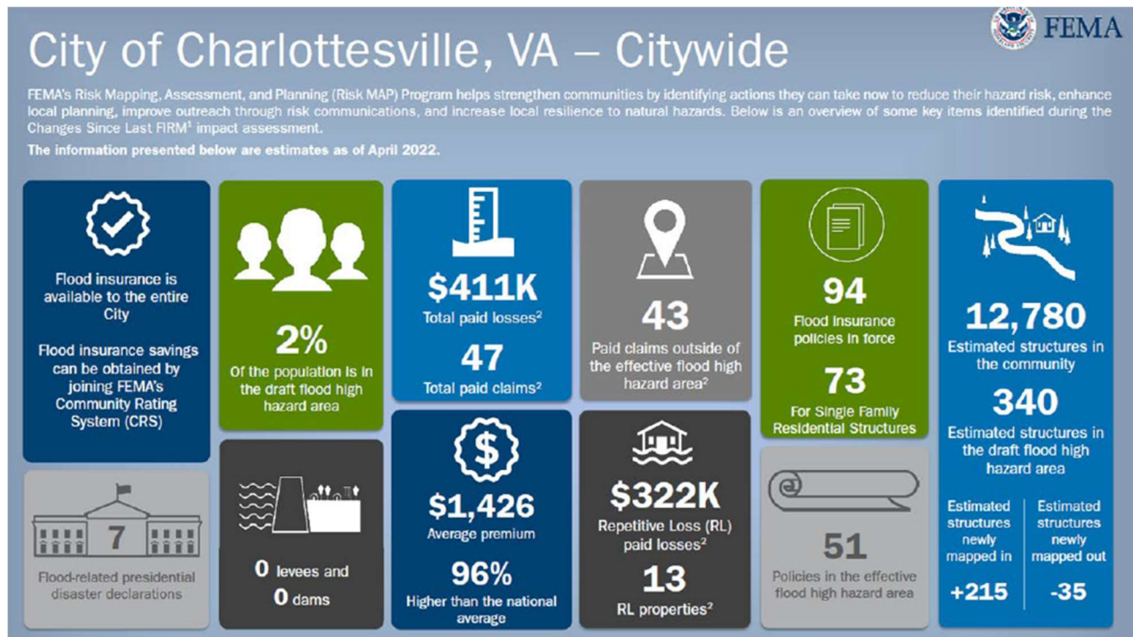
Figure 6: FEMA Dashboard of Charlottesville Risk MAP

Figure 6 shows the FEMA Dashboard for the Charlottesville Risk MAP with data on flooding events, flood insurance policies, and claims.