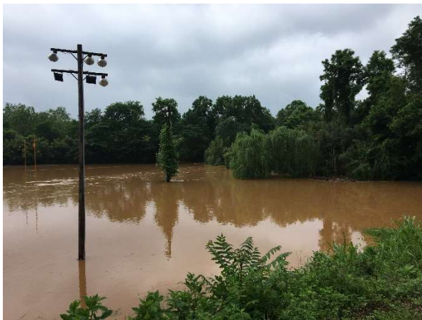
Figure 2: Rivanna River Flooding, May 2018

Figures 2-5 are photos of the Rivanna River Flooding in May of 2018.