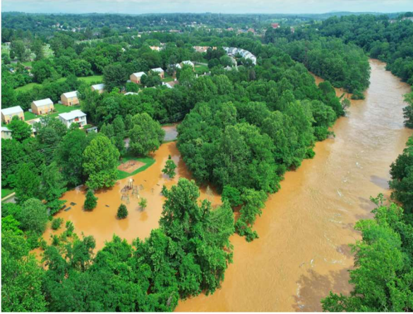
Figure 3: Rivanna River Flooding, May 2018