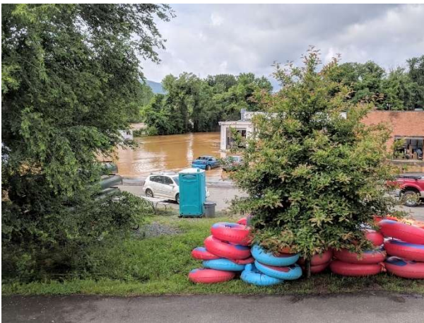
Figure 4: Rivanna River Flooding, May 2018