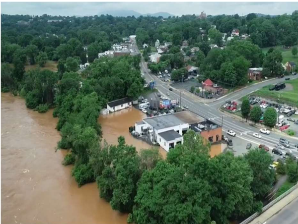
Figure 5: Rivanna River Flooding, May 2018